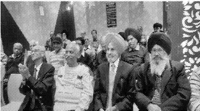
Ludhiana Unit meeting held on 25.11.2022