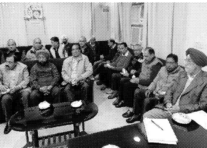
Jammu Unit Monthly Meeting