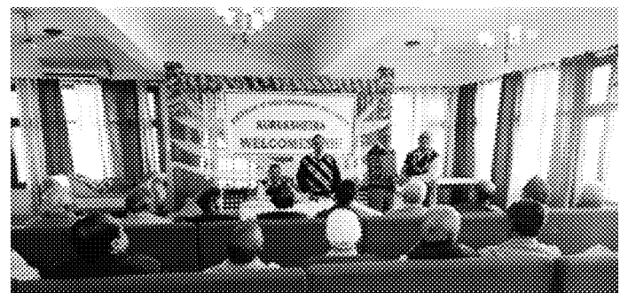
Kurukshetra Unit meeting held on 26.11.2022