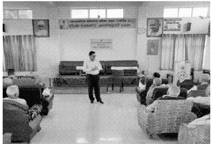
Kamal Unit meeting held on 24.11.2022