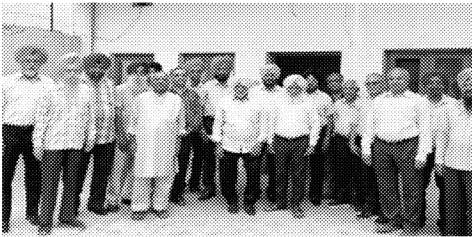
Khanna Unit meeting held on 17.09.2022